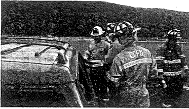
East Campbell Training